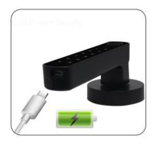
With USB Port for Emergency Power When the Batteries are Dead

With Backup Mechanical Key for Emergency Override