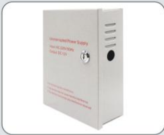
Switch Power Supply