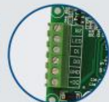
Terminal Blocks (Optional)