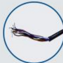
50cm cable (Standard)