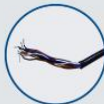
50cm cable (Standard)