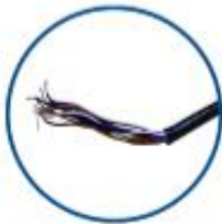
50cm cable (Standard)

Wiegand 26~37bits output (default: 26bits)