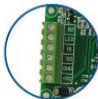
Terminal Blocks (Optional)