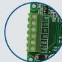
Terminal Blocks (Optional)