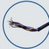
50cm cable (Standard)