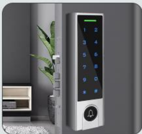
Touch keypad Access Control

The PIX-PCH3-S is a standalone TOUCH keypad access control with doorbell. It supports up to 990 common users + 10 visitor users, also supports multi access modes in card access, PIN access, card+PIN access, or multi cards/PINs access.